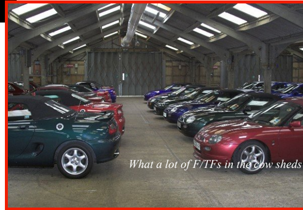
What a lot of F/TFs in the cow sheds !