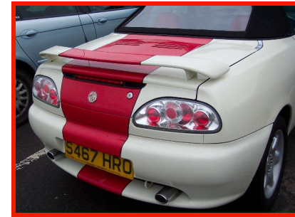
Old English White F with a nice red stripe in the car park

Scattered around the show were various other Fs and TFs in various guises including the MGOC silver car with it's new Land Rover Gasket kit. Out in the cow sheds I think we had the largest turnout of Fs and TFs we've seen so far at a Stoneleigh show and towards the end of the day when I wandered outside it seemed to be only F/TF and Zeds left out there. The show itself is still probably more attuned to the older MG with plenty of rusty wings and oily widgets to put on your restoration project however amongst it all there were some modern tuning and modification parts to be found.